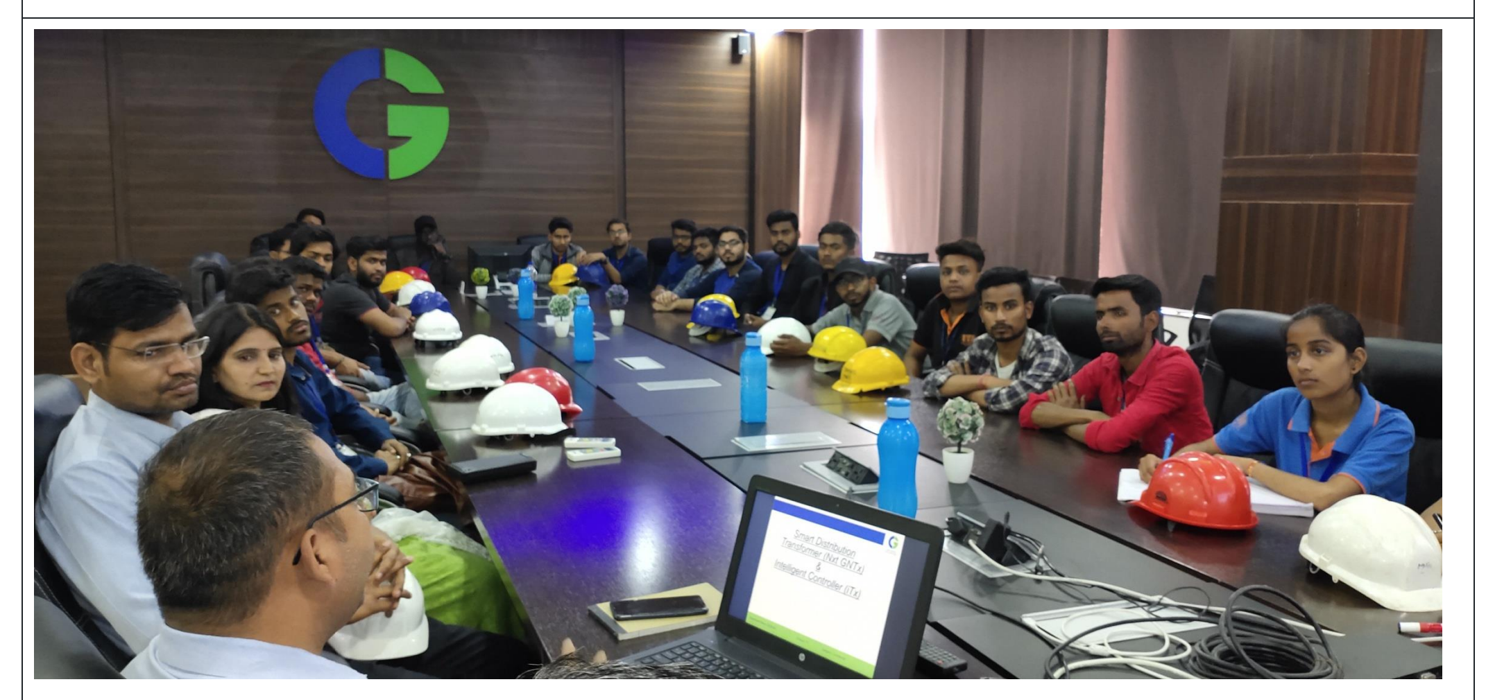
Social media news